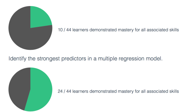
Figure 4. These visualizations show the proportion of learners who have mastered all of the skills associated with each learning objective.

Interpret the results of hierarchical multiple regression analysis and draw conclusions in context