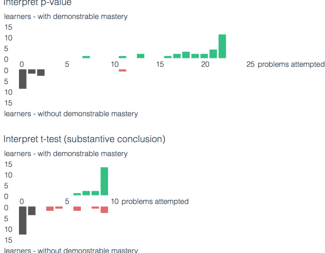
Figure 3. Each skill visualization plots the number of learners who have mastered a skill against the number of problems they have attempted. In the second case, several learners who have attempted many problems have failed to achieve mastery over the skill: "Interpret t-test.

finally click on a skill to see the problems associated with it. The idea behind this design was to direct instructor attention towards learner progress in terms of skill mastery and stated learning objectives rather than individual problem scores. The problems pages showed every problem associated with a skill, the number of learners who attempted each problem, and the number who got it right on their first and final attempt. The skills pages visualized learner mastery and non-mastery, in relation to the number of problems each of the course's learners had attempted involving said skill (Figure 3). The learning objectives pages visualized the number of learners who had demonstrated mastery on all the associated skills (Figure 4). To bring attention to skills with low levels of learner mastery, the landing page was expanded to display the three skills where learners had encountered enough problems to demonstrate mastery according to the BKT algorithm but were failing to show proficiency (Figure 2).